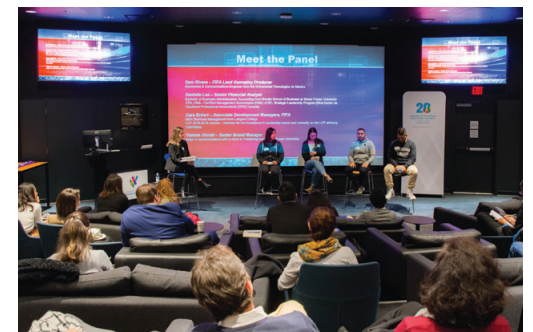
Members of the Leaders of Tomorrow mentorship program were invited to a behind-the-scenes tour at EA's Burnaby campus on Nov. 22, followed by a panel discussion with four EA leaders. | NAZ ILCIN