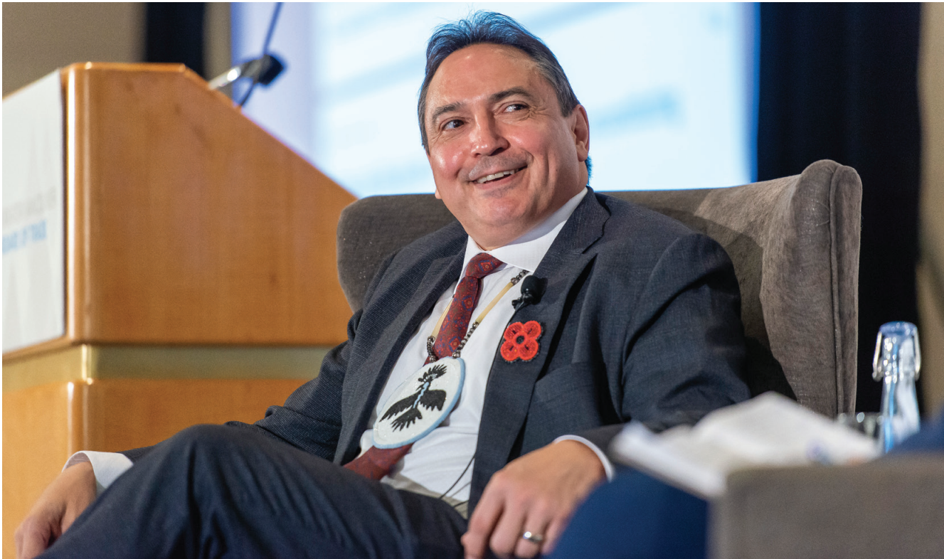
Assembly of First Nations National Chief Perry Bellegarde returned to the Greater Vancouver Board of Trade's stage on Oct. 29 for a keynote address to Western Canada's business community. In this year's address, National Chief Bellegarde shared highlights from the AFN's report Honouring Promises, which aimed to frame the dialogue around First Nations during the federal election and set the agenda for the next four years. For a link to the report and more photos from the event, visit boardoftrade.com/afn2019.