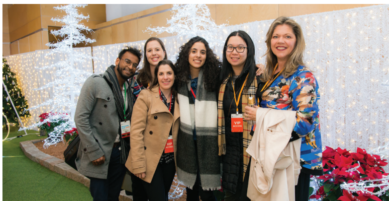
Members of the Board of Trade's four Signature Programs had the opportunity to mix, mingle, and revel in the holiday spirit during a special reception at Glow Vancouver's winter light gardens on Dec. 4.