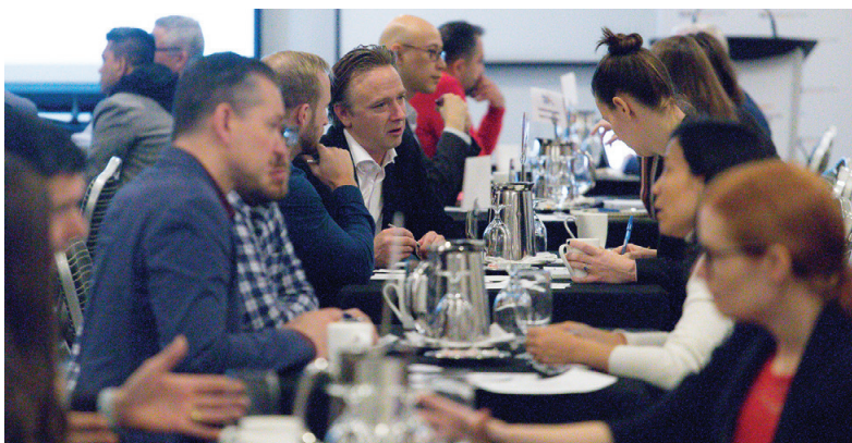
Business owners take part in World Trade Centre Vancouver's Trade Accelerator Program, a four-day workshop that helps companies create an export plan and tap into new markets abroad.