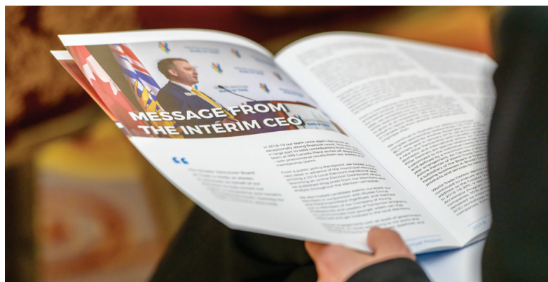
A Member thumbs through the Board of Trade's Annual Report prior to the start of the meeting. The report outlines some of the successes of the past year. Read the report at boardoftrade.com/annualreport19.

Did you know the Greater Vancouver Board of Trade hosts more than 100 speaker events, seminars, and networking receptions each year?