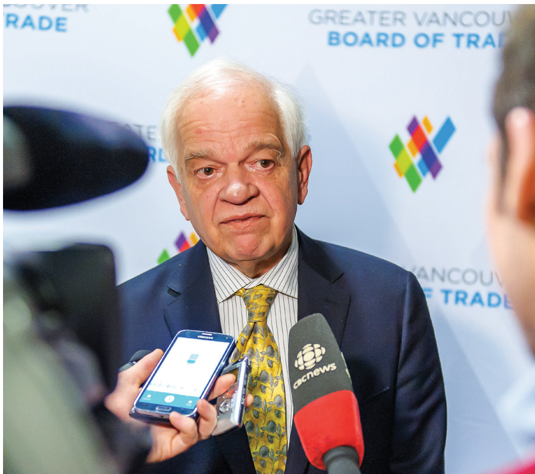
The Honourable John McCallum, Canada's Minister of Immigration, Refugees and Citizenship, speaks to media following his March 18 speech to the Greater Vancouver Board of Trade. In his remarks, McCallum discussed how immigration can contribute both socially and economically to our country.