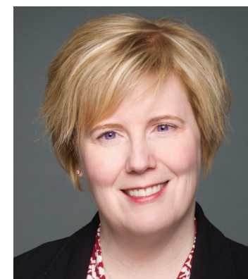
Carla Qualtrough, Canada's Minister of Sport and Persons with Disabilities

In addition, Qualtrough will also be working with her colleague, Minister of Health Jane Philpott, to deliver a national strategy for concussion awareness to ensure there is a responsible pan-Canadian approach to dealing with this highly prevalent type of brain injury.