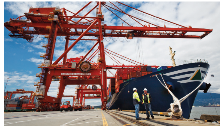
More than 20 per cent of Canada's exports flow through our port each year, yet there was no mention of the Pacific Gateway or trade-enabling infrastructure in the 2016 federal budget.

The lack of specifics in the budget unfortunately tempers some of "the good" listed above. While supports for industries such as high-tech