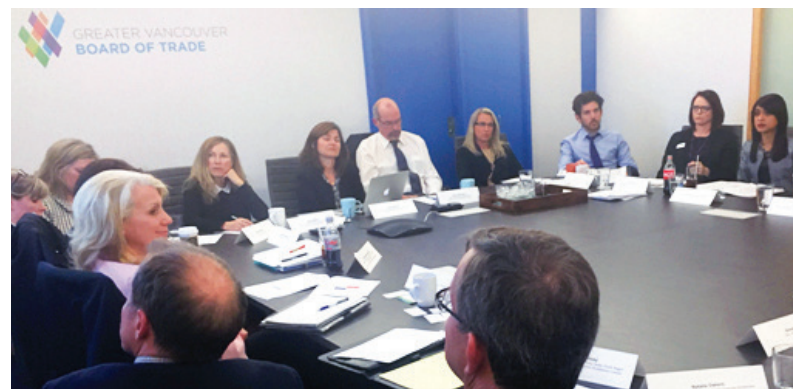
Canada's Minister of Small Business and Tourism Bardish Chagger (far right) visited the Greater Vancouver Board of Trade's office on March 29 for a roundtable discussion on female entrepreneurship. The event was co-hosted by the Women's Enterprise Centre.