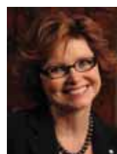
Carole Taylor Chancellor-SFU, and Governor, The Vancouver Board of Trade

Vancity Theatre at the Vancouver International Film Centre, 1181 Seymour Street