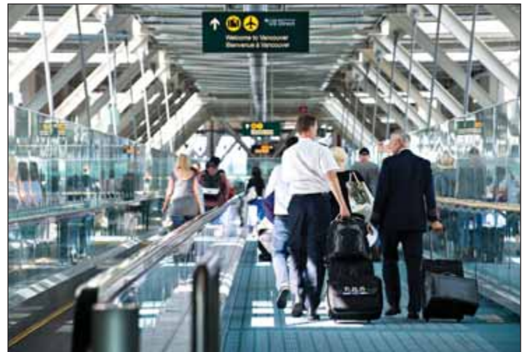
Passengers arrive at Vancouver International Airport.

For more info, visit www.worldairportawards.com .