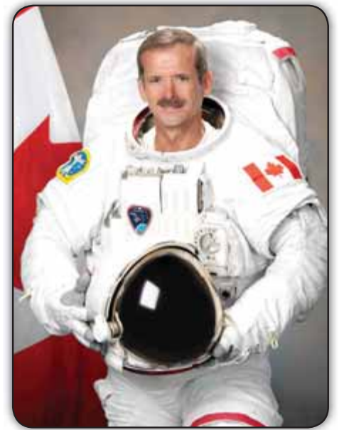
Canadian astronaut Chris Hadfield.

Although we cannot all be astronauts, we can make real, shared connections with others, just like Hadfield.