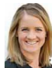
Darcy Marquardt Three-time Olympic Rower, London 2012 Silver Medallist