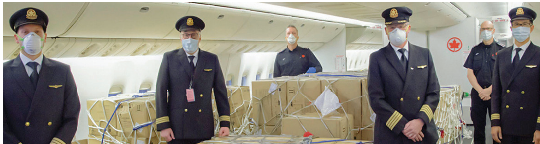
Air Canada's cargo plane crew

Air Canada subsequently leveraged its aircraft assets by quickly transforming some of its largest aircraft, four Boeing 777-300ERs and three A330-300s to transport cargo in the passenger cabin by removing up to 422 seats and installing nets. These aircraft can handle twice their regular cargo volume capacity, and their cabins are suited to loading lightweight items like PPE and mail.