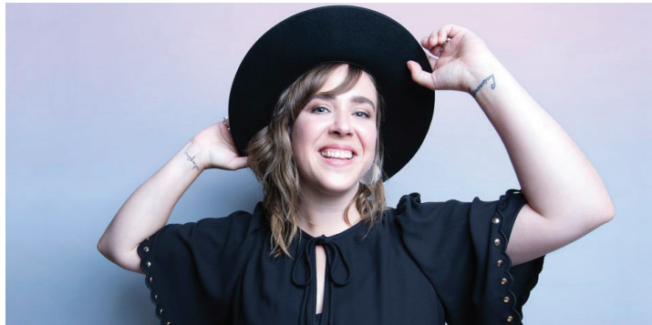
Singer-songwriter Serena Ryder will speak about mental health on Oct. 10.