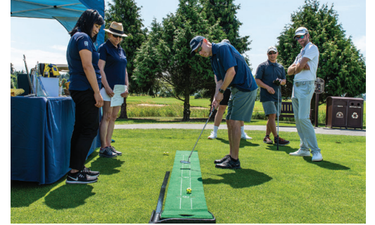
The BCIT Alumni Association hosted a putting and trivia contest on the first hole. Up for grabs was an eye-catching pair of yellow BCIT socks.