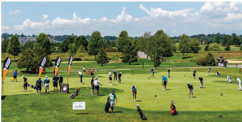
The putting green was packed as golfers competed in the Major Series of Putting (MSOP) contest for a chance to advance to the regional finals. The top eight finalists from B.C. would go on to the grand finale in Las Vegas.