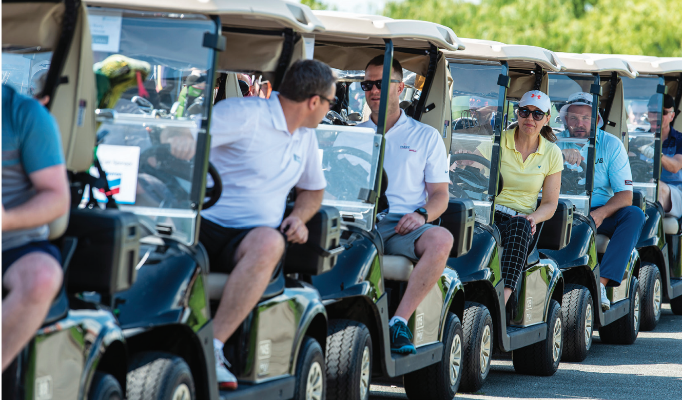
Golfers prepare to hit the links on July 15 for the Greater Vancouver Board of Trade's 2019 Pro-Am Golf Tournament. This year's sold-out tournament took place on the Canal Course at the legendary Northview Golf and Country Club in Surrey. A total of 36 teams took part in the tournament, with each team consisting of three golfers and one professional from the Vancouver Golf Tour. For more photos from this year's event and banquet dinner, visit facebook.com/boardoftrade.