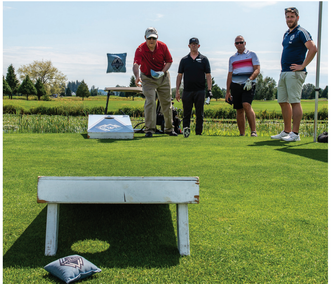
Another popular on-course activity was the cornhole toss at Hole 9, hosted by the team from Vancouver Whitecaps FC. This year, every hole was sponsored by a company, the majority of which provided games, entertainment, snacks, or prizes.

Did you know the Greater Vancouver Board of Trade hosts more than 100 speaker events, seminars, and networking receptions each year?