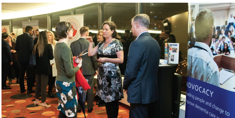
The Company of Young Professionals program hosted its second annual 'Night of Non-Profit Board Recruitment and Engagement' on Jan. 22 where attendees met with more than 20 different local non-profits.