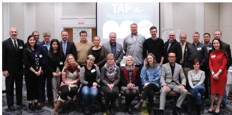
World Trade Centre Vancouver headed to Kelowna in early February for the latest cohort of its popular Trade Accelerator Program. On April 24, the program heads to Abbotsford. Learn more about the program and how to apply at tapbc.ca .