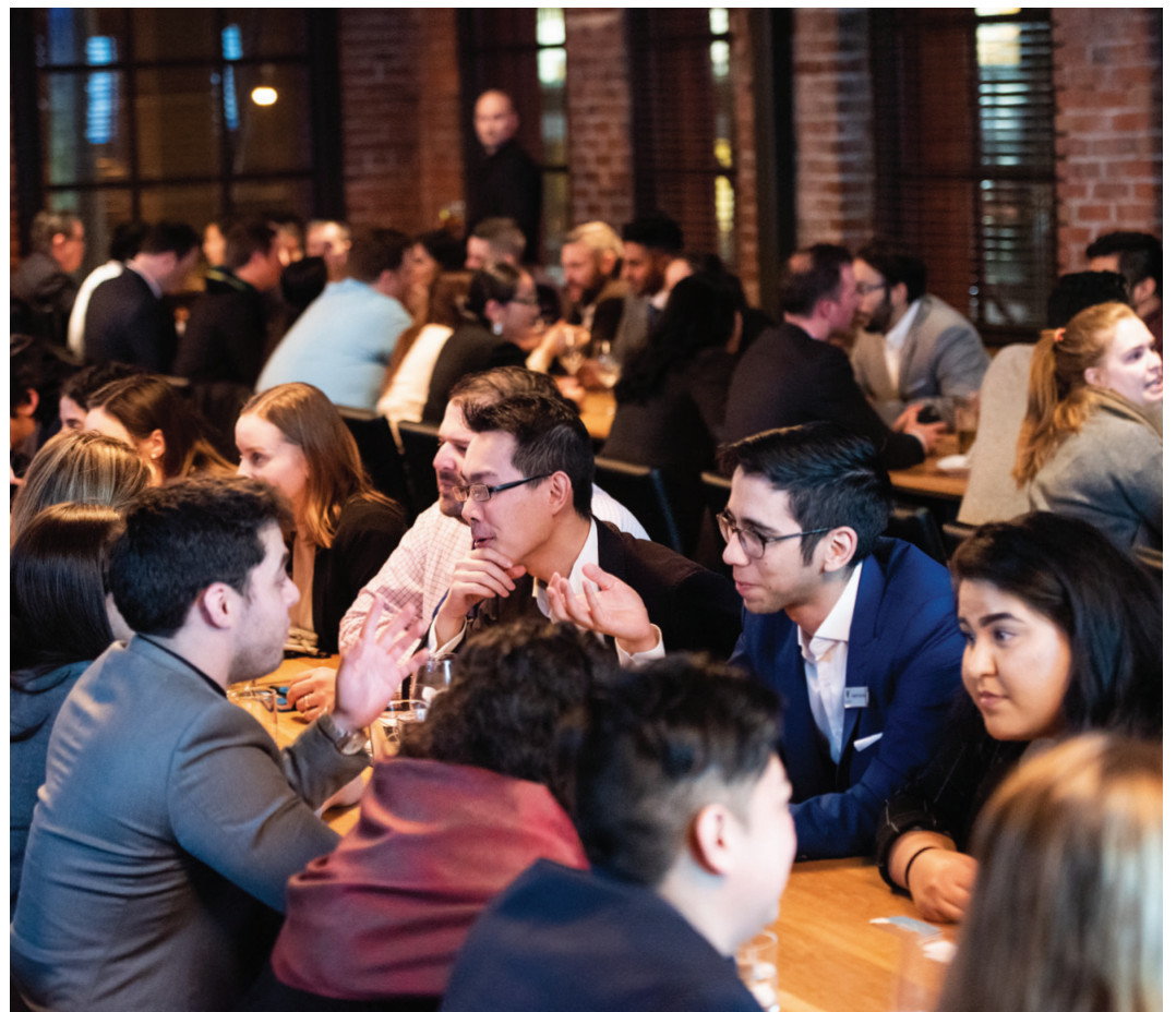
Participants in the Greater Vancouver Board of Trade's mentorship program, the Leaders of Tomorrow, gathered at The Loft at Earls on Jan. 23 for the program's 13th annual Speed Networking Night. Learn more about the program at boardoftrade.com/lot.

Did you know the Greater Vancouver Board of Trade hosts nearly 130 speaker events, seminars, webinars, and networking receptions each year?