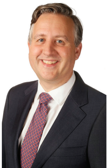
Mayor Kennedy Stewart

Stewart was elected the 40th Mayor of Vancouver and the city's first independent mayor in three decades. Born in Nova Scotia, Stewart moved to Vancouver in 1989 with only $100 in his pocket and worked odd jobs