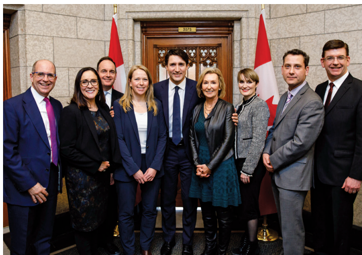
The CEOs from Canada's eight largest urban chambers of commerce met with Prime Minister Justin Trudeau during a trip to Ottawa last month.

2. City and city-region leaders would lead the development of long-range priority plans for urban infrastructure. As in other jurisdictions, provincial governments, agencies, institutions and other stakeholders would sign on to agreements between Ottawa and cities or city-regions to execute on these plans, drawing the maximum possible buy-in and helping to maintain a system-wide focus on priorities.