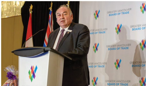
The Greater Vancouver Board of Trade hosted Northwest Territories Premier Robert McLeod on Jan. 25 for an address on sustainable development in Canada's north.