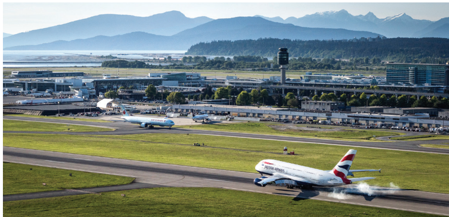
The Greater Vancouver Board of Trade is heading to the Canadian Chamber AGM in Regina this month, where the organization will partner with other chambers to call for increased air access and the creation of a national aviation strategy.

The resolution offers suggestions on how