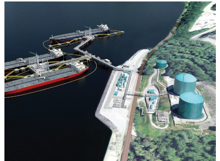
This conceptual photo shows what Westridge Terminal could look like if the Trans Mountain Expansion Project gains approval.

included the Business Council of B.C., the B.C. Chamber of Commerce, and the Canadian Chamber of Commerce. Similar to the Board of Trade, they also expressed their support for the expansion, highlighting the rigor of the NEB process and the national, provincial and local economic benefit that the proposed Trans Mountain