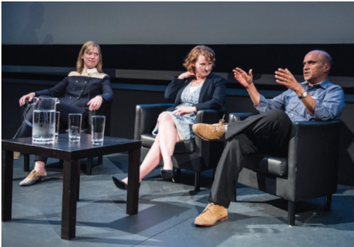
The Leaders of Tomorrow mentorship program partnered with CPA BC to host an event with accounting leaders on Aug. 17. Learn more at boardoftrade.com/LOT .