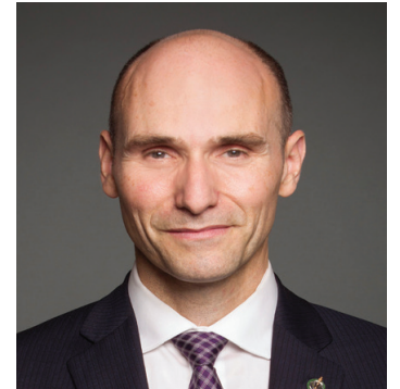
The Honourable Jean-Yves Duclos

In his remarks, Duclos will discuss the federal government's vision to keep housing in Canada's urban centres affordable and accessible for everyone.