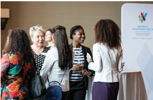
Members of the Women's Leadership Circle make connections during a July 7 event at the Terminal City Club. Want to get involved? Visit boardoftrade.com/WLC .