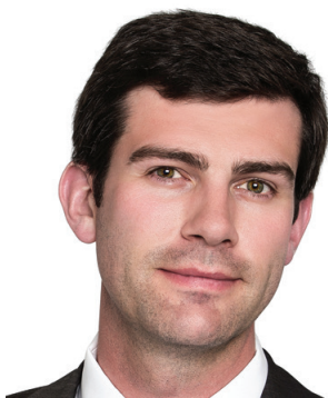
Mayor Don Iveson

Edmonton is a surprising leader when it comes to defining a practical pathway to energy resilience