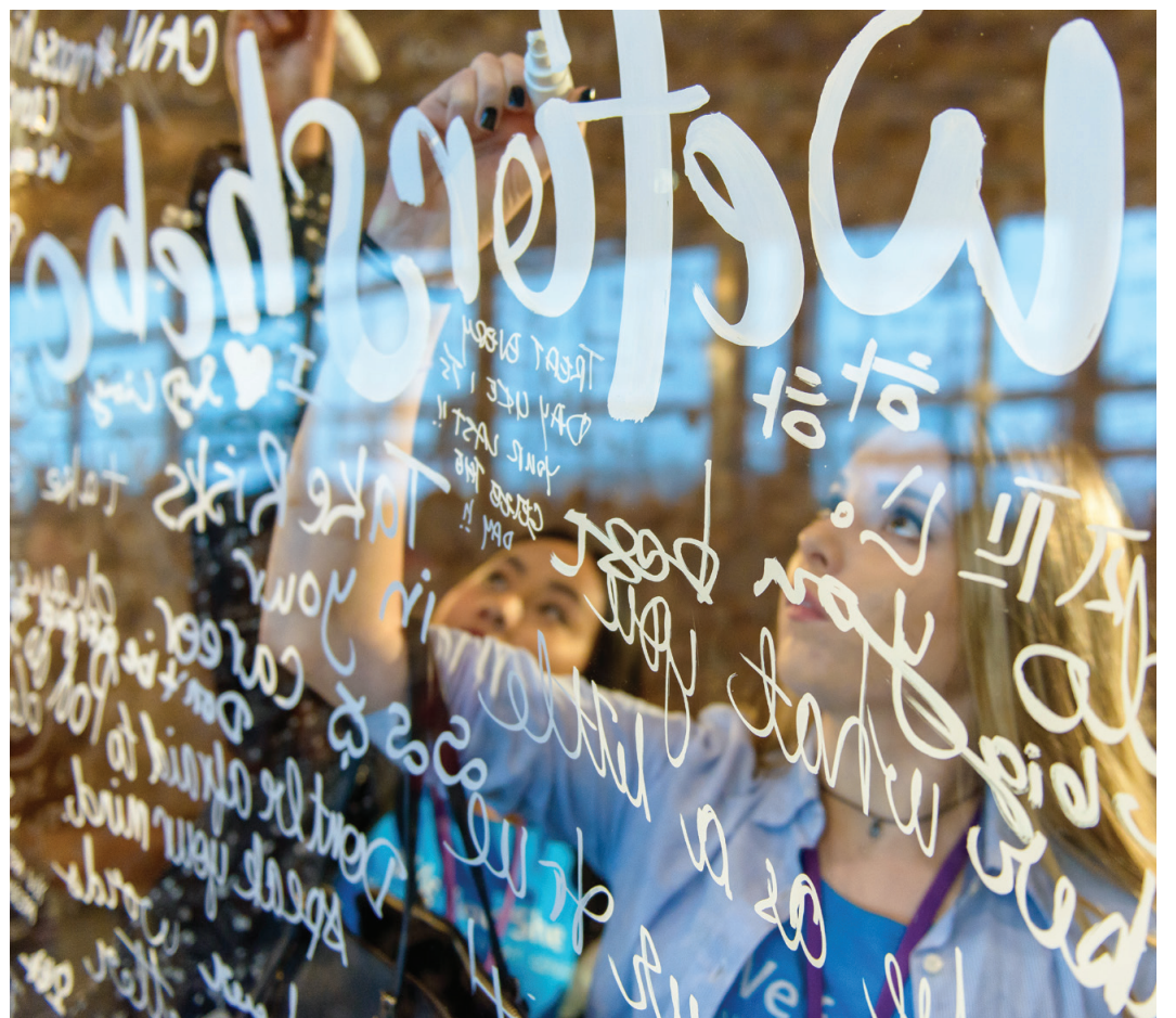
An attendee writes an inspirational message on a glass box created by Wakefield Productions. The box was meant to symbolize the invisible 'glass ceiling' that some women still face in business, sciences, the skilled trades, and other professions.

Check out the full photo gallery, videos, and a stream of social media posts at WeForSheBC.ca