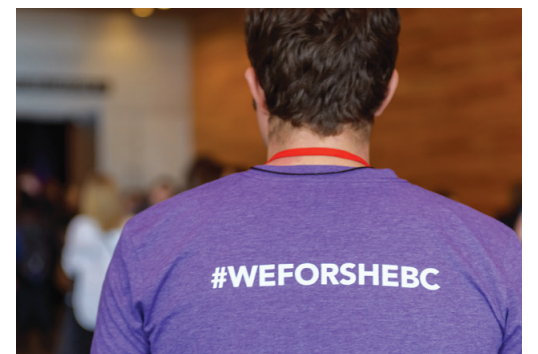
Countless volunteers pitched in to bring WE FOR SHE to fruition, representing more than a dozen partner organizations. | MATT BORCK