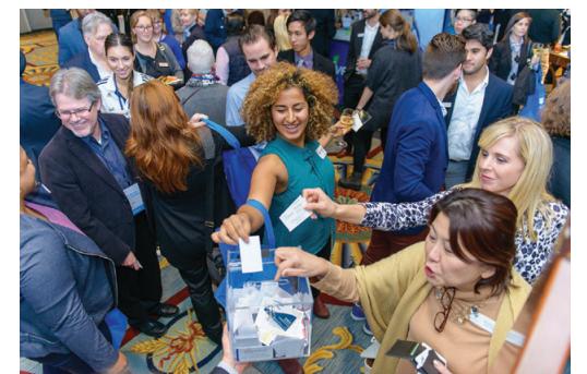
Attendees place their business cards in a prize draw at the Greater Vancouver Board of Trade's third annual trade show on Oct. 26.