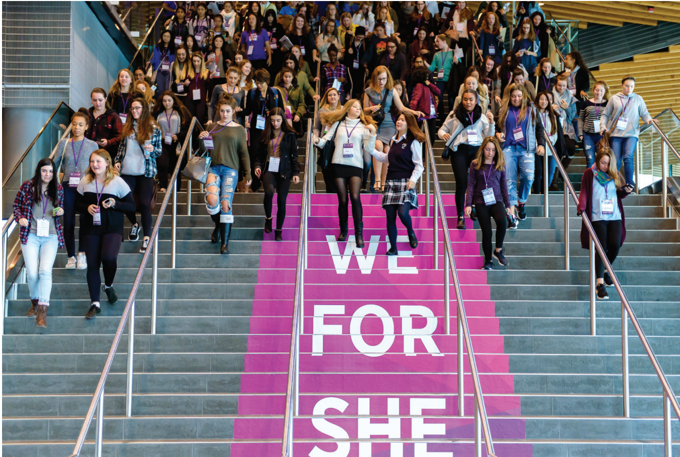
Here they come! B.C.'s next generation of women leaders filled the Vancouver Convention Centre on Oct. 14 for the highly anticipated WE FOR SHE Conference. In total, 700 high-school students from across the province participated in the full-day event.